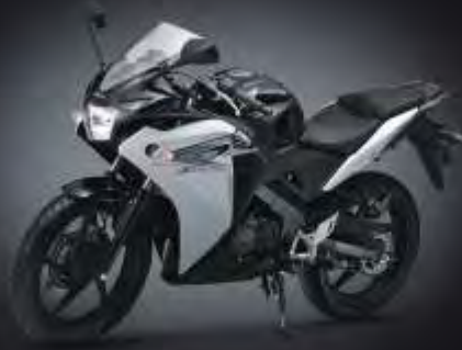
BLACK & PEARL SUNBEAM WHITE