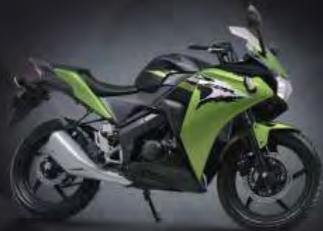
BLACK & CANDY PALM GREEN