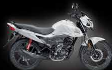
Pearl Amazing White