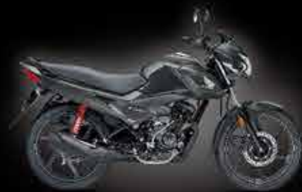
Matte Axis Gray Metallic