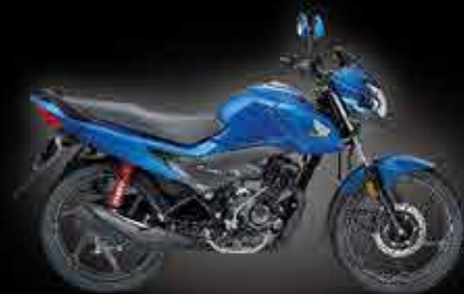
Athletic Blue Metallic