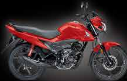
Imperial Red Metallic