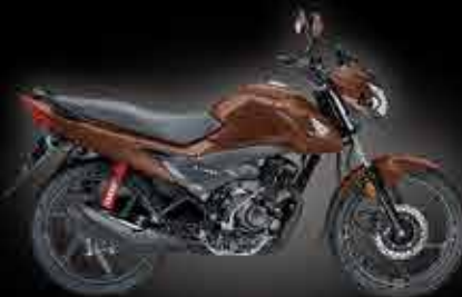
Sunset Brown Metallic